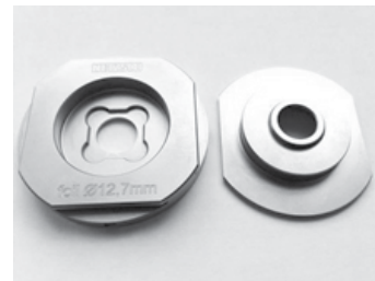
Foil sample holder 12.7 mm / 25.4 mm