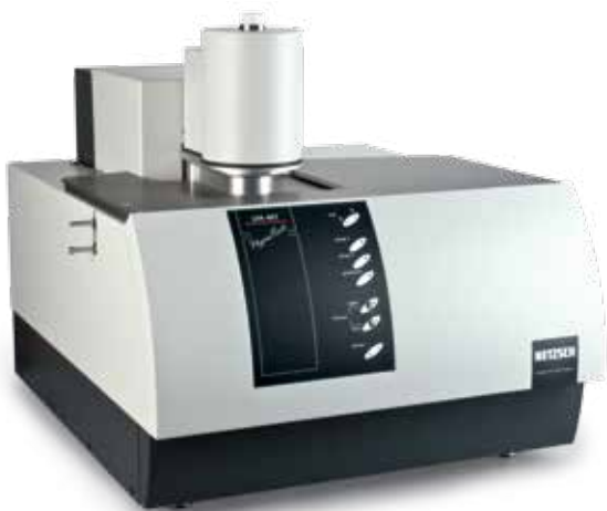
1 LFA 467 HyperFlash ® MCT: 2 ... 13.5 \mu\text{m}