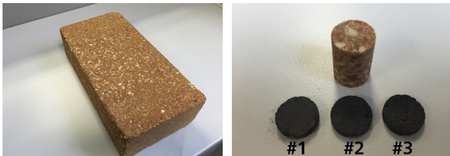
4 Magnesia-spinel brick (85% MgO, and 12% Al 2 O 3 ), measured with the TCT 426 (left) and the LFA 427 (right); the 3 LFA samples were coated with graphite.

possible now [1]. In addition, the fast testing times of the flash methods allow for measurements of various samples taken from the brick to be tested without further efforts. In the work described herein, the results from laser flash and the hot-wire measurements on a silicon carbide-containing brick and a magnesia-spinel brick are compared. Measurements were carried out on several small samples of the same material to check the homogeneity of the material and the reproducibility of the methods.