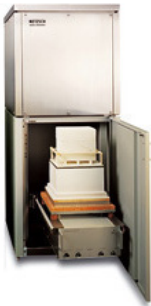
1 NETZSCH TCT 426