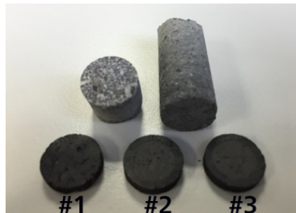
6 Silicone carbide-containing brick (45% Al 2 O 3 , 29% SiO 2 , and 25% SiC), measured with the TCT 426 (left) and LFA 427 (right); the 3 LFA samples were coated with graphite.

Furthermore, the deviation between the different samples shows the possible range of the thermal conductivity due to the inhomogeneity of the magnesia-spinel brick. A similar comparison of LFA and TCT measurements on silicon carbide-containing brick (figure 6) is shown in figure 5. Again, the independent measurement values are all within \pm 10\% of the averaged data from the two methods combined.