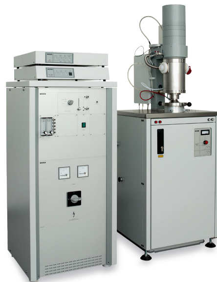
2 NETZSCH LFA 427