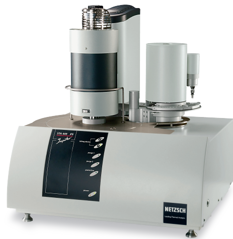
1 STA 449 F5 Jupiter®

The STA measurement was carried out between room temperature and 1450°C. The DSC curve (blue) depicts the melting of a hastelloy sample (alloy 22) at 1358°C (extrapolated onset) with an enthalpy of 165 J/g. During cooling, crystallization occurred at 1351°C (extrapolated endset) with nearly the same enthalpy change (red DSC curve). During heating and cooling, neither a mass loss nor an increase due to oxidation was observed (TGA Signals).