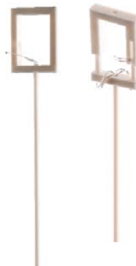
Sample carriers for hanging samples, see also Accessories for Differential Scanning Calorimetry and Thermobalances

These \text{Al}_2\text{O}_3 sample carriers and sensors with \text{Al}_2\text{O}_3 frame are available for the STA 449 F1/F3 Jupiter ® systems. The sample carriers are easy to handle and allow selection of the hanging wires according to the sample properties.