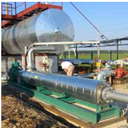
Transfer pump for crude oil in Russia