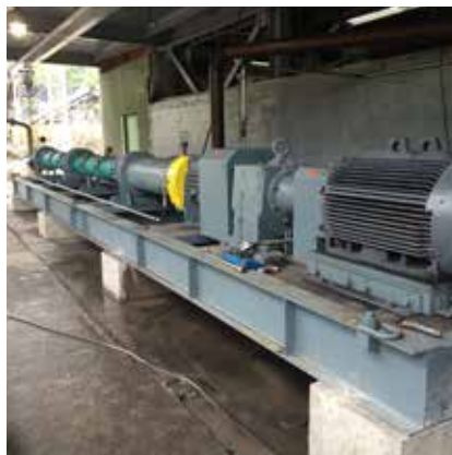
Slurry pump for coal mine in USA