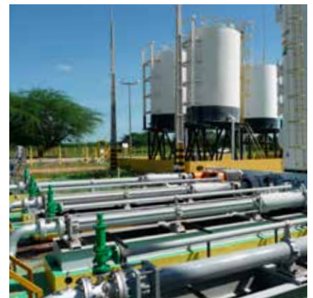
Oil loading pump in Brazil